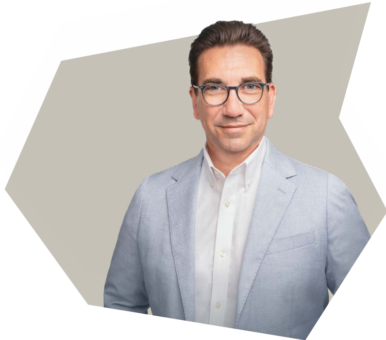
Hendrik Wüst Mdl Minister-President of the State of North Rhine-Westphalia